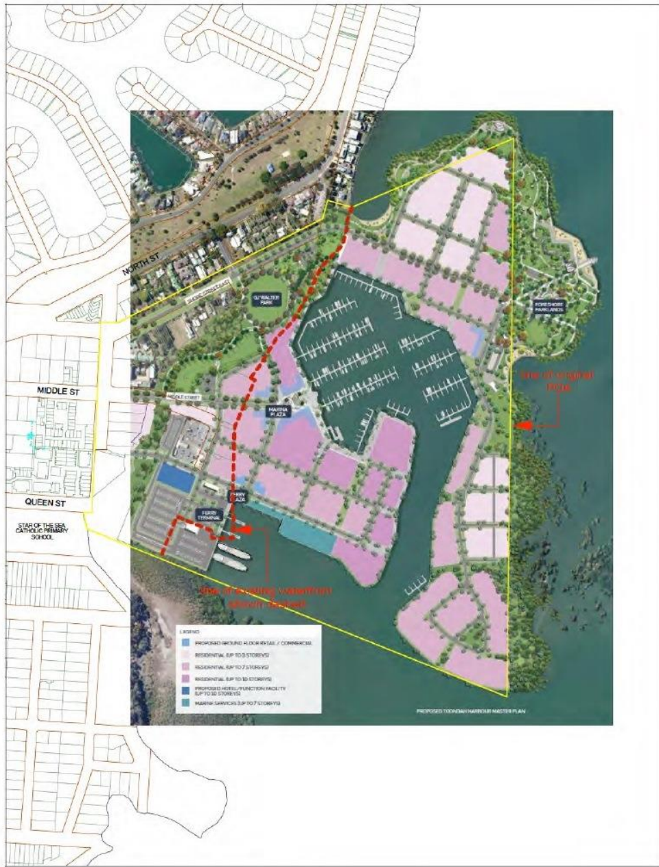
WALKER GROUP DEVELOPMENT PROPOSAL -DESCRIPTIVE COMMENTS OVERLAID